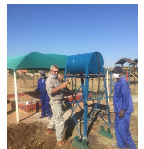
Hand washing station

Again, world-wide Team IMD Africa helped finance projects. You know who you are. We know who you are and God especially does.