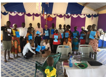
Leaders at Kolokol