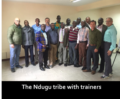
The Ndugu tribe with trainers