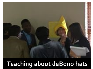
Teaching about deBono hats