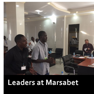
Leaders at Marsabet

We're excited by the fruit of the various ministries and men taking the entrustment from God and sharing it with other leaders.