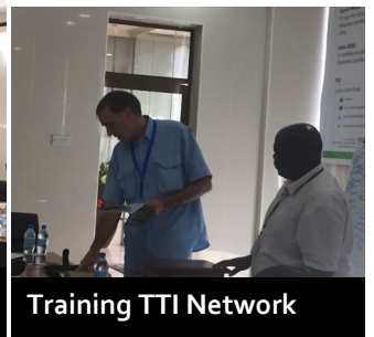
Training TTI Network