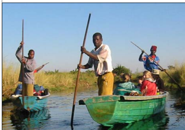
8—10 hours travel by banana boat is common in this region of Zambia

One prayer request comes with the report from the swamps region of Northern Zambia. We need a boat to more effectively carry out our church planting and disciple making. This boat will cost roughly $2,725.